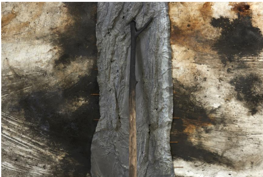
< Murderers Creek (detail) 2018-19 Ink and earth on paper, steel, lead, wood 84 x 84 x 39 inches