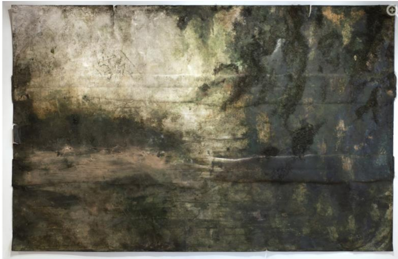
< Bulbancha (Green Silence) 2019 Ink, Mississippi River mud, Spanish moss on paper 132 x 204 inches