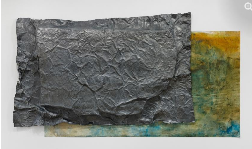
17th Century 2021 Shellac ink on paper, and lead, steel 59.25 x 93.25 x 5.5 inches (overall)