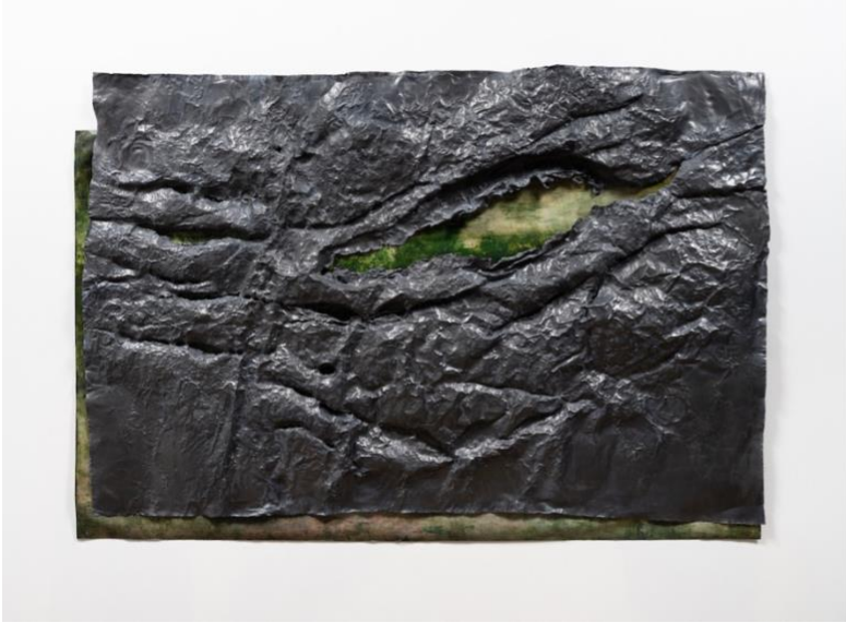
> Of Mad and Willful Nature 2022 Shellac ink, Hudson Highlands mica on paper and lead, steel 50 x 73 1/2 x 3 inches