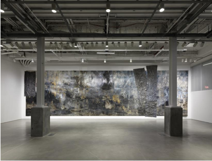
> In the Wake of . . . 2021 Sumi and shellac ink, earth from The Green-Wood Cemetery, demolition debris from downtown Brooklyn on paper, and lead, sound 198 x 652 x 7 inches duration: 50 minutes Installation view: BRIC House, Brooklyn, New York.