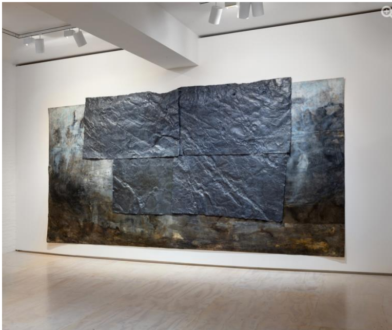
< > It Came From the North (angle) 2021 Shellac ink, earth from the Green-Wood Cemetery, New York City demolition debris, glass microbeads from the NYC DOT on paper, and lead 112 1/2 x 222 x 6 inches

Installation view: Greater New York 2021, MoMA PS1, Queens, New York.