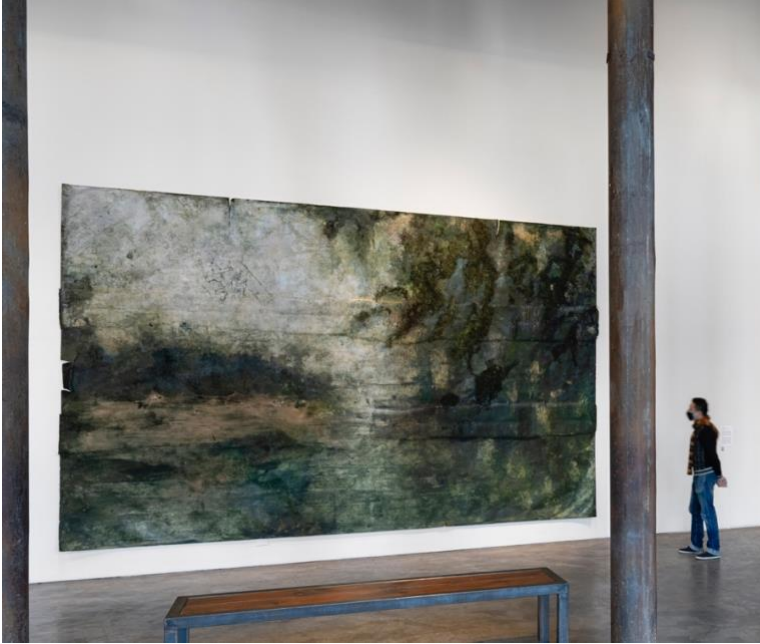
Bulbancha (Green Silence) 2019 Shellac ink, Mississippi River mud, Spanish moss on paper 132 x 204 inches Installation view: Land Akin , Smack Mellon, Brooklyn, New York