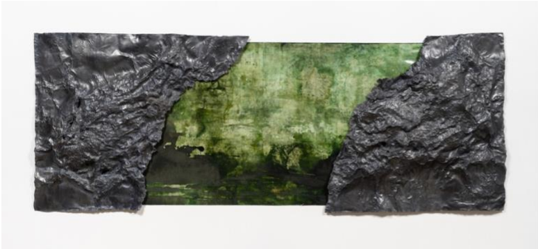
> The Discovery of Slowness 2022 Shellac ink, silt from a Garrison stream, Hudson Highlands mica on paper, and lead, steel 46 x 122 x 4 inches