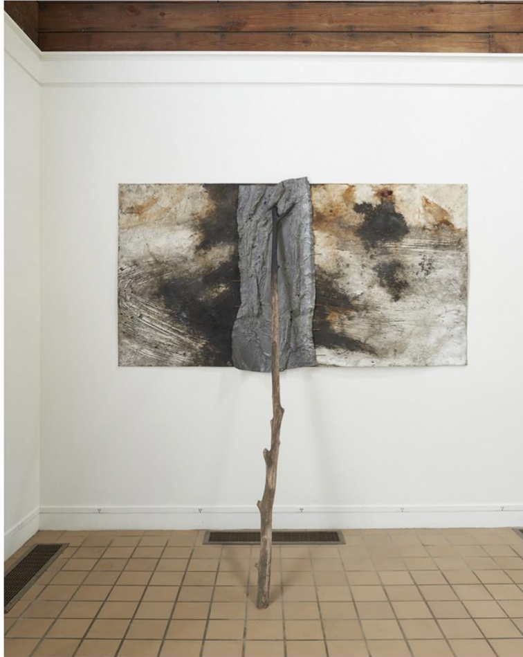
Murderers Creek 2018-19 Ink and earth on paper, steel, lead, wood 84 x 84 x 39 inches