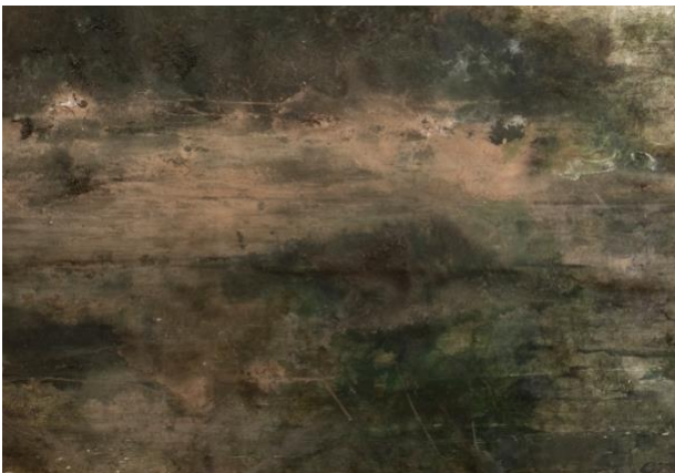
Bulbancha (Green Silence) (detail of Mississippi River mud) 2019 Shellac ink, Mississippi River mud, Spanish moss on paper 132 x 204 inches