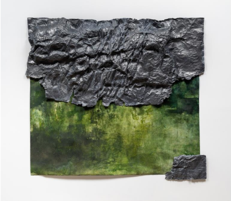
> As Night Devours the World 2022 Shellac ink, silt from a Garrison stream, Hudson Highlands mica on paper, and lead, steel 65 1/4 x 73 x 4 3/4 inches