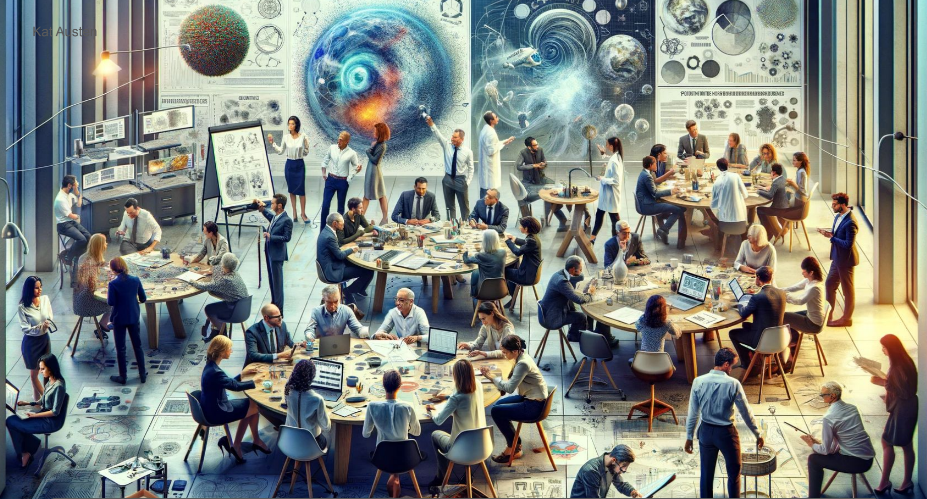
Make another image with policymakers working as part of an art-science project